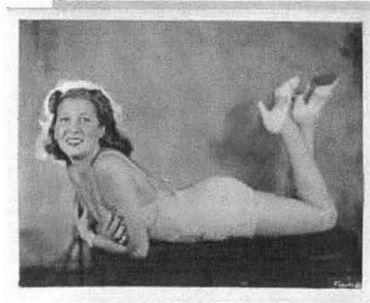
"The weekly bathing beauty contest continues to draw throngs of spectators and a flock of bathing beauties who compete for the weekly prize and therefore become eligible to compete on Labor Day for the title 'Miss Seaside.'" - 1938 (Unidentified bathing beauty c. 1930's from the CBRM photo collections)

We continue to recruit new volunteers. If you have any friends who would like to join our group of dedicated workers, please bring them by the museum or suggest they visit on their own. Even if a volunteer can give only a few hours a month, we have a job for them. No contribution is too small!