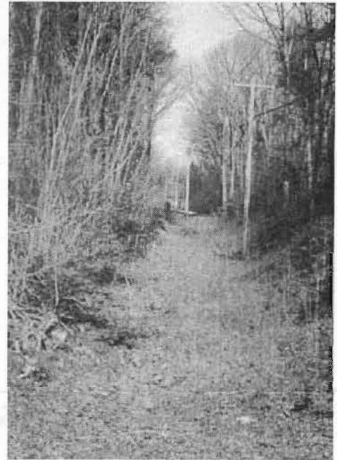
Portion of the Drum Point Railroad right-of-way still visible off Rout 765 across from Middleham Chapel in Lusby.

In 1924, one last attempt to complete the line came down to Anne Arundel and Calvert Counties' willingness to provide $500,000. Calvert agreed, but her neighbor to the north declined, and the dream of a railroad to Drum Point died for all time. Bits of B&DPRR right-of-way can still be identified at a handful of places in Calvert County.