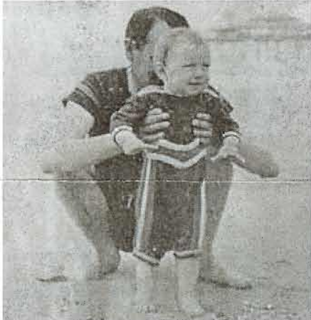
Baby's first day at the beach.

This year we plan a small celebration on June 9 to honor the date when the Chesapeake Beach Resort welcomed the first visitors in 1900. We hope to make Founder's Day an annual event. Join us for the festivities. We plan games for the children since this will be the first day of summer vacation. There will also be refreshments and a sneak preview of the Swim Suit Collection. The activities take place during our regular open hours, 1:00 to 4:00 pm. This is a Friday, so plan to start your weekend with a pleasant afternoon at the Museum.