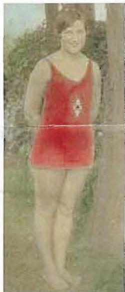
Mildred Finlon at Chesapeake Beach in 1921

The Friends of the Chesapeake Beach Railway Museum are extremely happy and proud to announce their first Fund-Raiser and Friend-Raiser. It will be held on July 1, 2006, noon to 2 p.m. This stunning event will be a Vintage Swimsuit Fashion Show & Picnic on the Beach. It will be held rain or shine at the Rod "N" Reel Restaurant. Tickets are $25.00 each and are available for purchase at the Railway Museum now open daily, 1-4 p.m. during the spring and summer season.