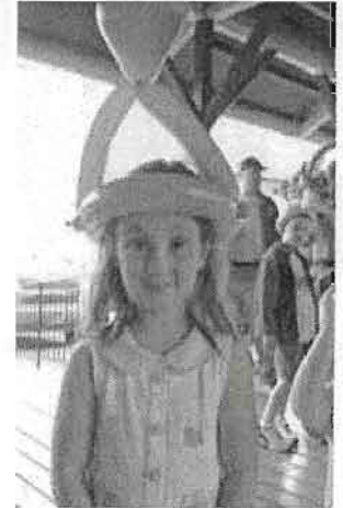
A young lady enjoys balloon sculptures at a previous Family Fun Day

The Family Fun Day events are free of charge.