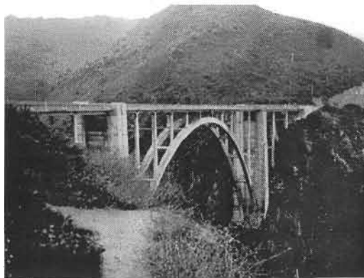
Bixby Bridge carries Highway One of Mill Creek along California's Big Sur coast. The 1932 reinforced concrete, open spandrel bridge is 714 feet long and 265 feet high.

land Bay Bridge to the San Francisco Ferry Terminal and other points in the city, arriving finally at my hotel near the cable car terminal at Market and Powell Streets.