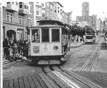
Cable cars approach the turntable at Market and Powell Streets in San Francisco.

Los Angeles seemed almost anti-climactic, but I spent an enjoyable two days exploring the city by bus and light rail, taking a boat ride around Long Beach harbor and visiting the pier at Santa Monica. Finally I boarded AMTRAK's Southwest Chief at the beautiful Spanish/Art Deco L.A. Union Station and watched as the desert southwest rolled by my window. Arriving in Chicago, I boarded the Capitol Limited for the overnight trip back to Washington and home, another successful rail journey around this amazing country of ours.