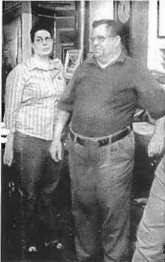
Joe with his daughter in 2006 at the Museum