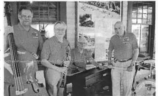
Not So Modern Jazz Quartet

A special thanks to the Rod 'N Reel Restaurant for providing those yummy cookies and lemonade that