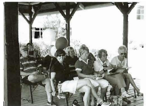
Right: Volunteers and guests enjoy the show.