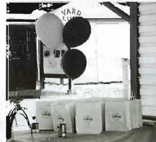
Goody bags were presented to all volunteers who worked hours during the 2009 year.

It was very enjoyable and we hope that they will return some other time. For the record our Chesapeake Beach station is 113 years old this year!