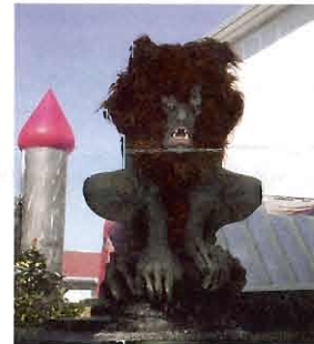
A gargoyle perches menacingly.

including two train sets, a train DVD set, and a Halloween quilt, were won by local people. Participants were busy all day with the craft tables, face painters, and snacks. Spring will bring another Family Fun Day with a Beach Theme, which is in the planning stages now. There is a very mysterious twist in the works. Look for more info in the new year!