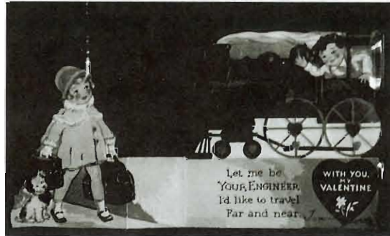
Children's valentine with train engine. "Let me be YOUR ENGINEER. I'd like to travel Far and near with you, My valentine."